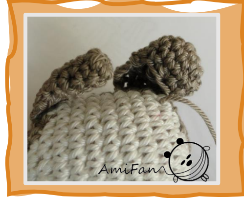
Before sewing al together, fill up with a bit fiber fill.