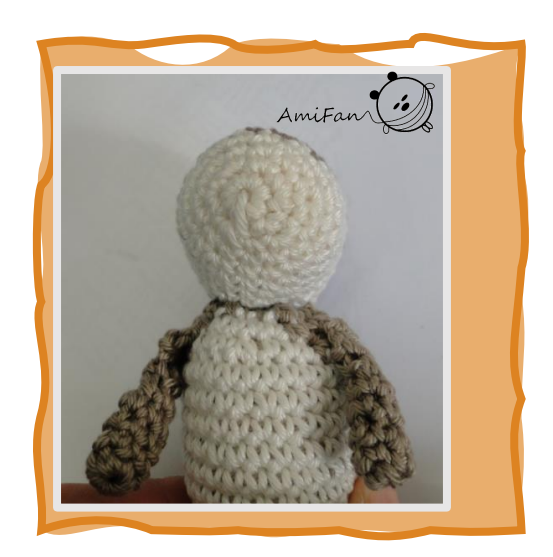
Sew the two arms on the side... on the brown parts. Sew the legs on the bottem.