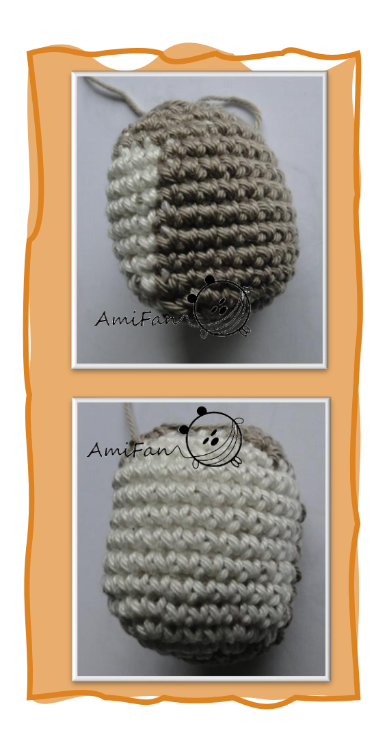
Leg front (2x)