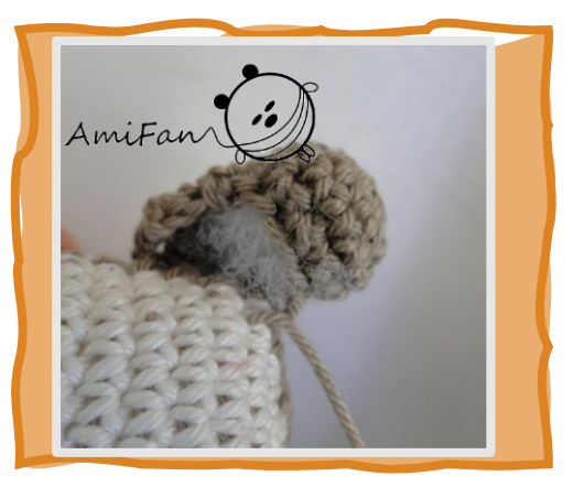
Sew further on the body. This must look like this