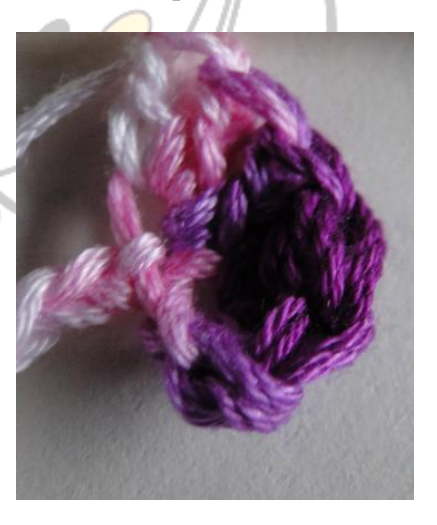
R41. White, crochet on R40, *2sc, (1sc in next st, 1sc in same st, 1sc in next st) * repeat till you are at the end

R34 – 38. Chain of 1, haak 7sc in next st (7), turn R39. Color. Crochet chain of 30, chain of 2, turn R40. * 3 dc in every st (start on chain number 3e from crochet hook).* Repeat 30x